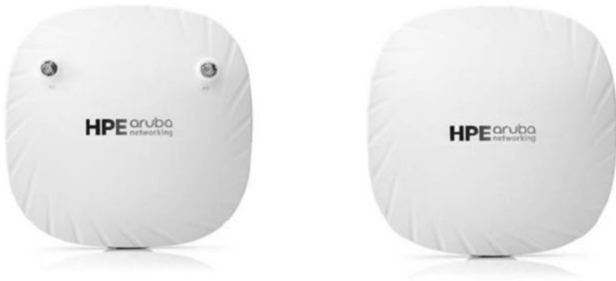
HPE Aruba Networking 500 Series Campus Access Points

These affordable Wi-Fi 6 access points provide high-performance connectivity for any organization experiencing growing numbers of mobile, IoT and mobility requirements. With a maximum aggregate data rate of 1.77 Gbps (1.774 Gbps), they deliver the speed and reliability needed for venues and workplaces such as schools, midsize offices and retailers.